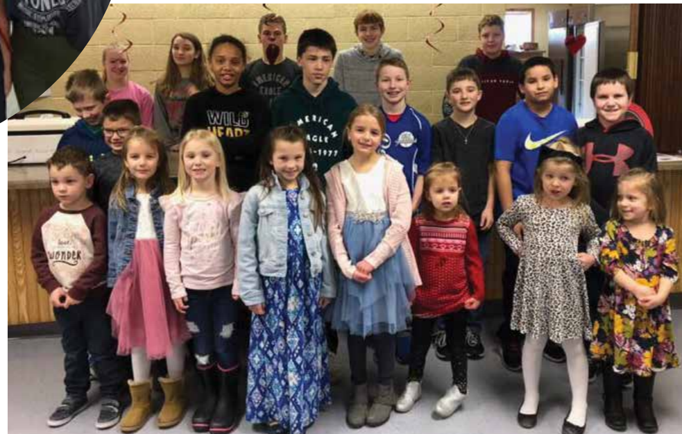
Faith formation class of St. Joseph’s Church in Brooks, MN raises more than $4000 to benefit a family thousands of miles away in Chimbote, Peru.