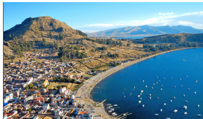
Lake Titicaca - Puno 3 days/2 nights