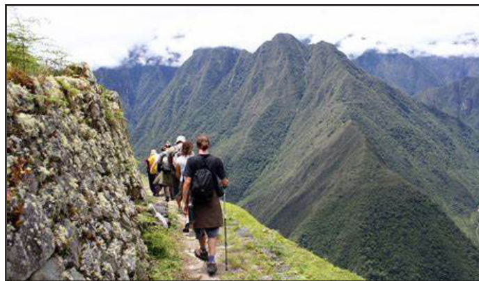
Inca Trail - Cusco 4 days/3 nights (can be longer)