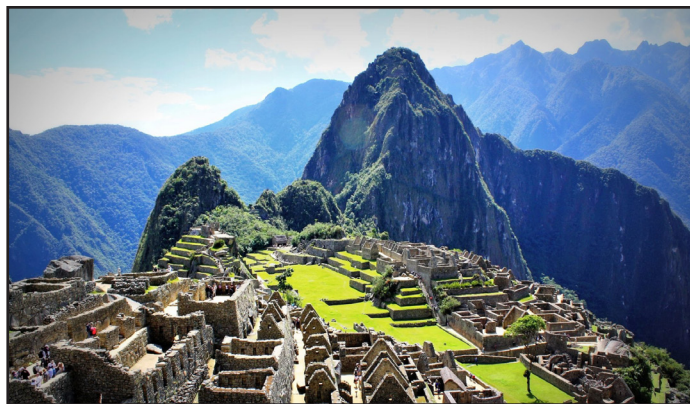
Machu Picchu - Cusco 4 days/3 nights